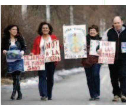
Organisers of the March in Norrköping

She hopes that the group grows as much in support of other organisations as in real people who want to join the March.'