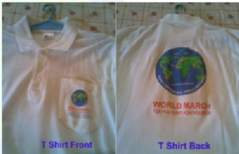
T Shirt Front