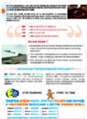
Leaflet - back

WORLD MARCH FOR PEACE & NON-VIOLENCE www.worldmarch.in • www.worldmarch.info Rakesh : 9821561235 • Viren : 9328696031